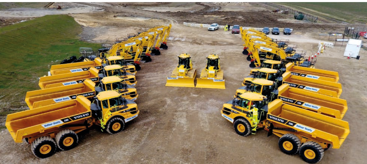
Balfour Beatty machinery

We value and embrace diversity and equality, putting them at the heart of what we do. We are proud that the gender balance of our team is almost equally balanced and that we continue to recognise the benefits of building a balanced and diverse team, addressing all aspects of diversity.